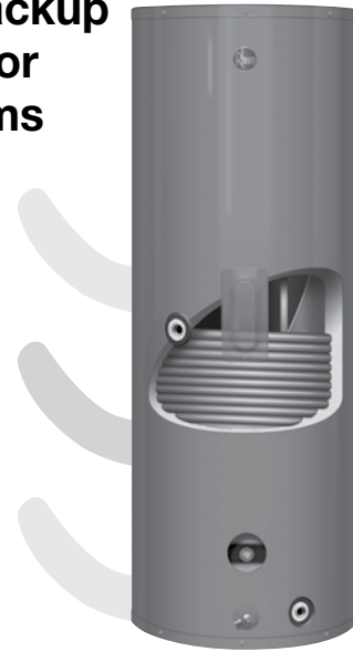
Solaraide HE Tanks 80 and 120-Gallon Capacities Heat Exchanger Electric WHs and Storage Tanks

Units meet or exceed ANSI requirements and have been tested according to D.O.E. procedures. Units meet or exceed the energy efficiency requirements of NAECA, ASHRAE standard 90, ICC Code and all state energy efficiency performance criteria.